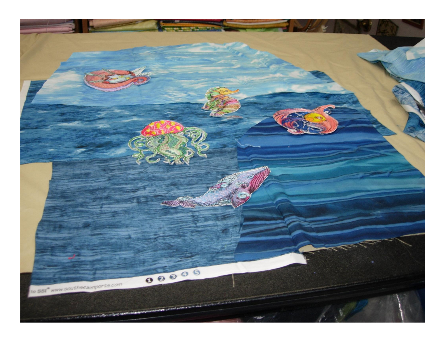
Here are my fabrics for the water – the designs are just laid out to give me an idea.