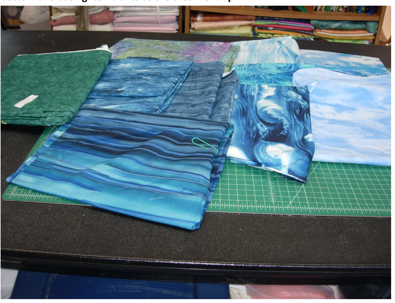
STEP 2: Gather fabrics to use. I started with the center ocean slice. I wanted a darker fabric at the bottom and use lighter fabrics as the area went up.

If you are using this method it is best to stitch all the designs and prepare them with the web before starting your quilt. Then you can lay them all out as you choose fabrics. You can also do a combination of the two methods!