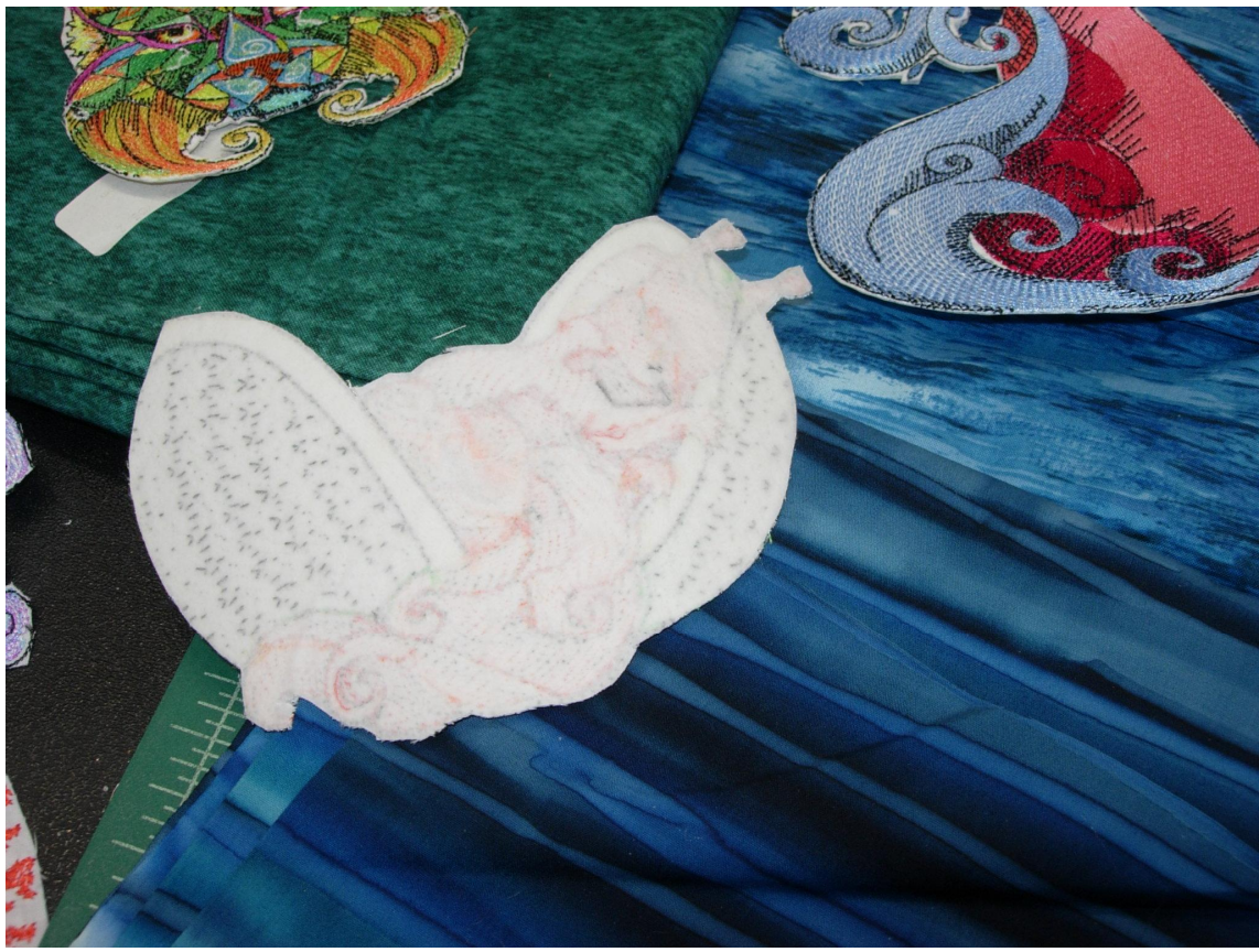
Shows the back of a design with the web fused on and then cut out.