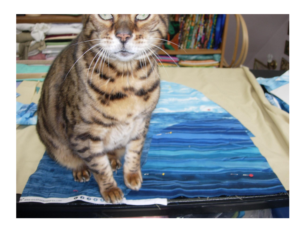
Get the supervisor to approve your work so you can continue. He gets so serious!